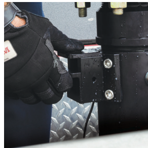
Easy-op latch design for safe and simple deployment