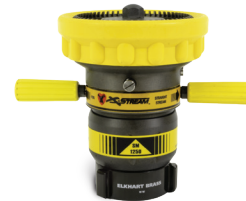
SM Series Automatic Nozzle

This is intended as a guide only. For all options and configurations, please contact your Elkhart Brass Regional Sales Manager or Customer Service.